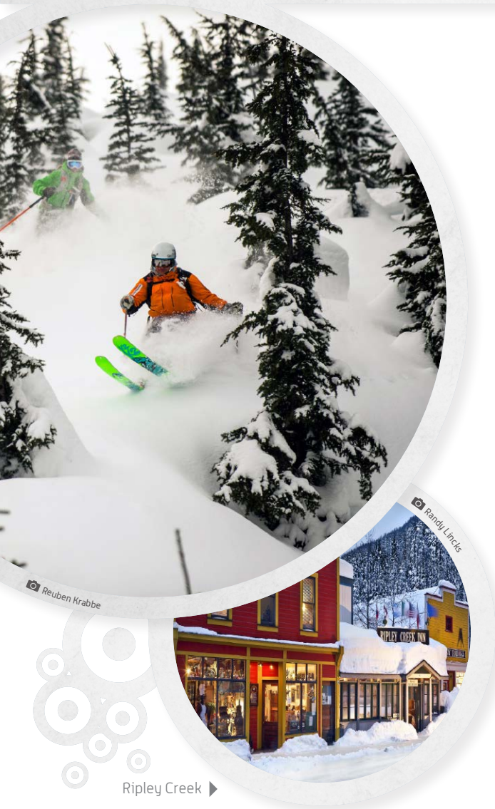
Ripley Creek ▶