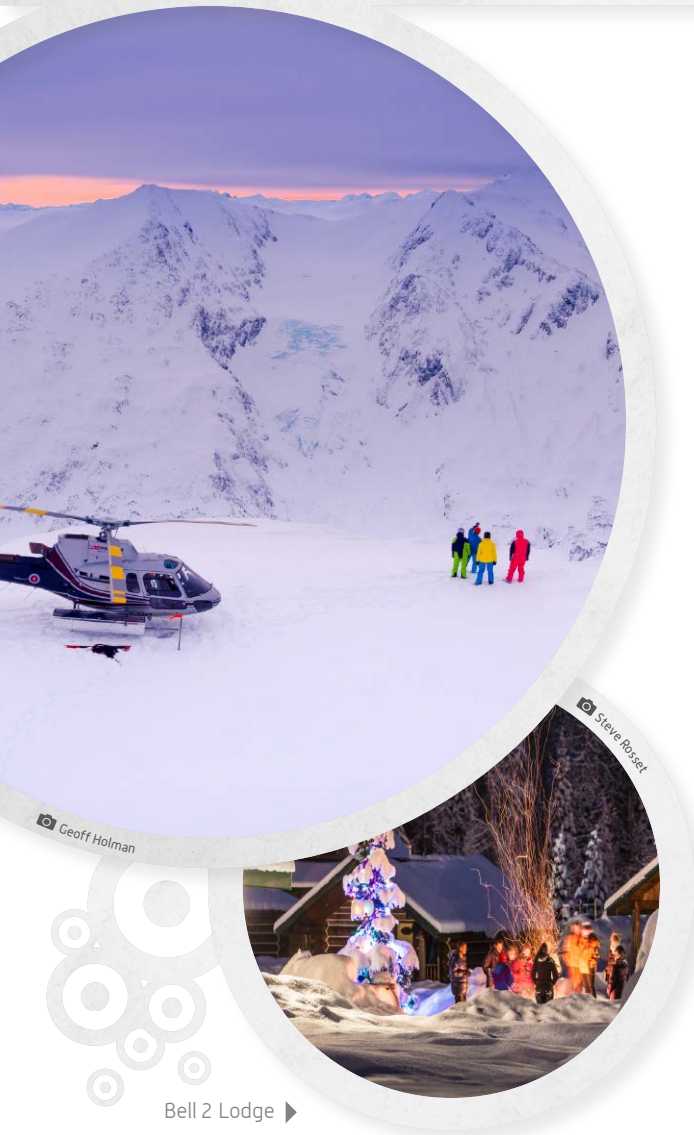
Bell 2 Lodge ▶