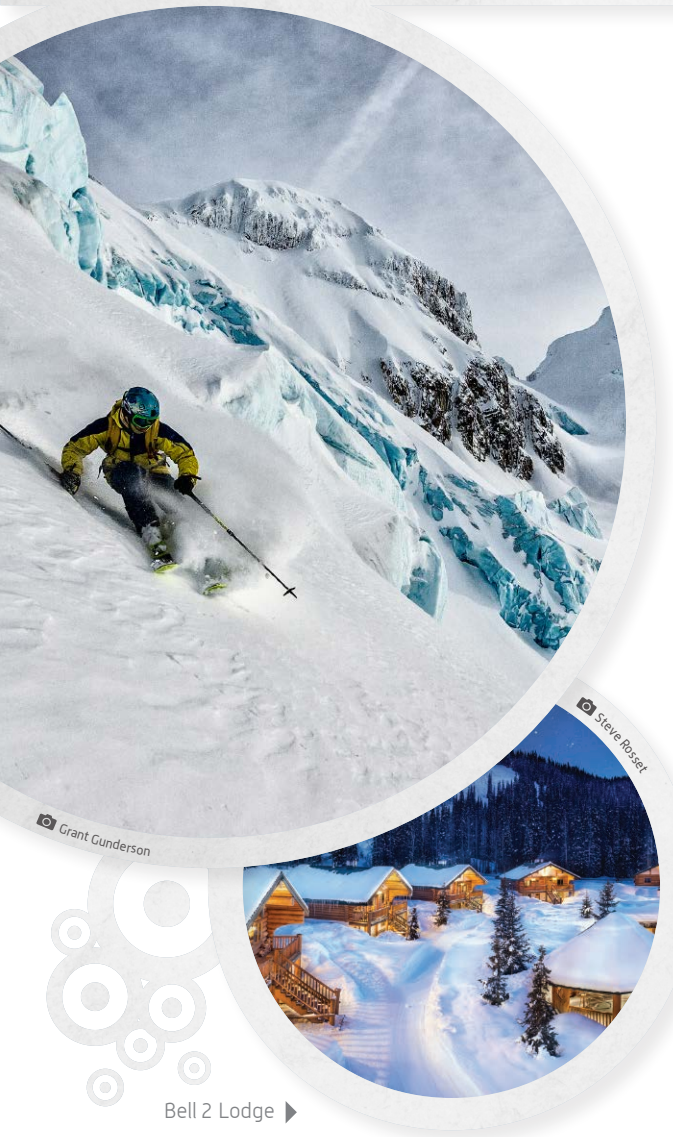
Bell 2 Lodge ▶